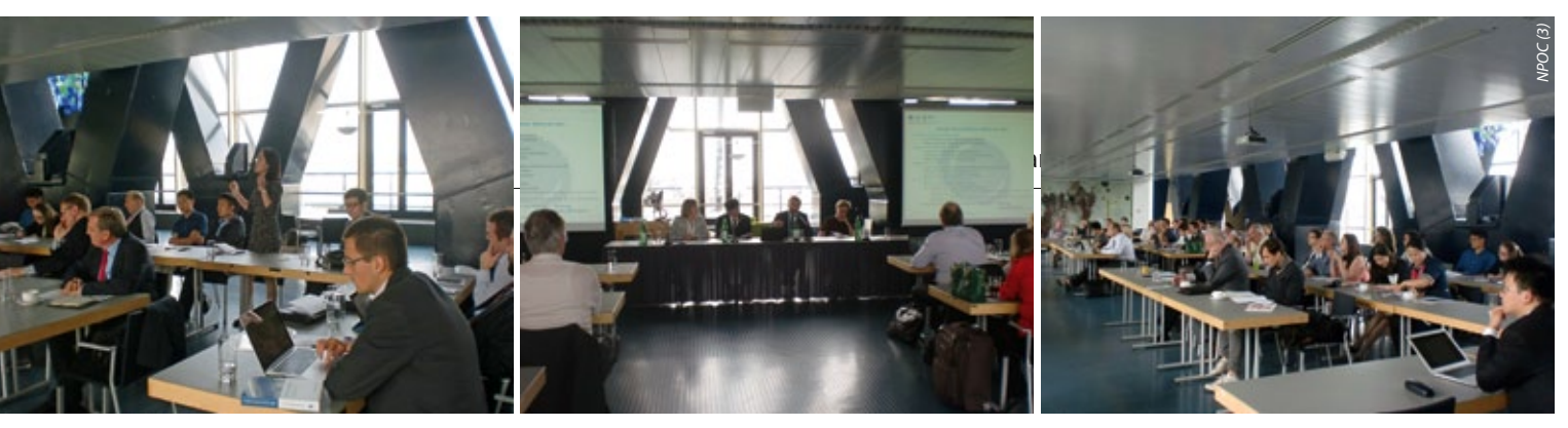
Three expert panels discussed the international aspects of the legal and policy issues involving the developing private sector activity in space