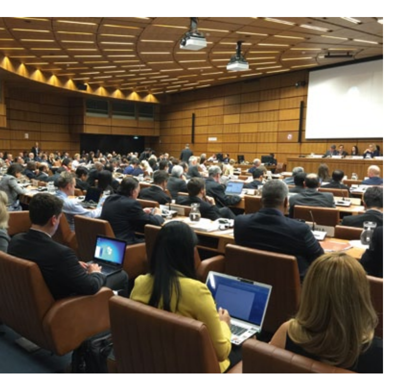
UNCOPUOS meets annually in Vienna, Austria, to discuss questions relating to current and future activities in space

did get involved with high altitude balloons for atmospheric measurements. Since my background is in experimental space physics, especially in spectroscopy, I was building farinfrared interferometers and conducting measurements in the stratosphere. At the time, the destruction of the ozone layer was starting to become an issue, so for my thesis work, I developed instruments to find out more about this depletion. After my studies, I was offered a job at a Canadian company that was developing and building the type of spectrometers I had constructed for my doctoral thesis, although with infinitely more sophistication! I worked there for four years but then decided that I wanted to get back to my scientific roots and accepted a position as a programme scientist at the Space Science Division of the National Research Council of Canada. When the Space Agency was created in 1989, my position was transferred over to the newly formed Agency.